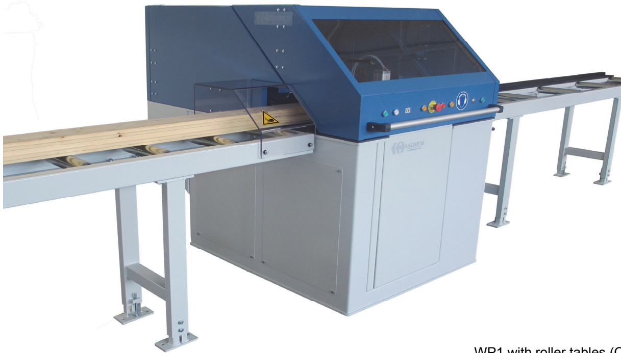
WP1 with roller tables (Option)